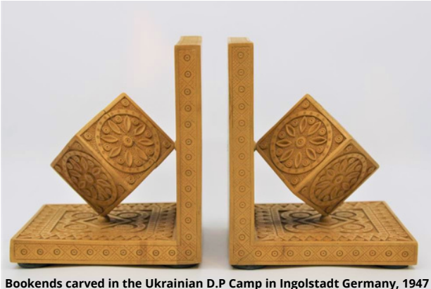
Bookends carved in the Ukrainian D.P Camp in Ingolstadt Germany, 1947

Our collection of DP camp artifacts includes numerous wood-carved objects - bookends, containers, boxes, vessels, plaques, plates, as well as clay vases. The DP camp art comes from the heart and speaks to the soul.