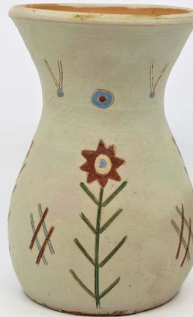
Vase made in Ukraine D.P camp Orlyk in Berchtesgaden, Germany.

Oseredok Museum Collection is honoured to be a home for the unique art created by Ukrainians held in various Displacement Camps in Germany such as Ingolstadt, Berchtesgaden, Landau, and Waiblingen. DP camps provided Ukrainians with an opportunity to lead active civic, cultural, religious, political, educational, economic, literary, and artistic lives within the imposed restrictions. Between 1946 to 1947, the American zone alone included 1820 plays, 1315 concerts, and 2044 lectures. There were 49 choirs and 34 drama groups. Each camp had 2 or 3 events staged every week.