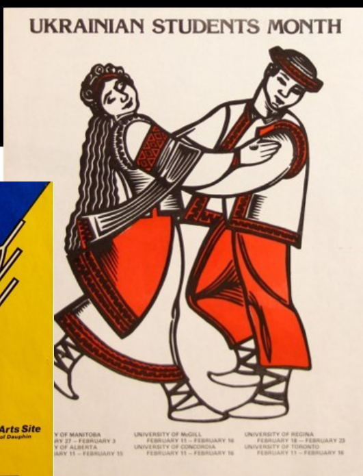
Examples of community event posters the Archival Technicians have been sorting through.

"Oseredok has an extensive poster collection, featuring our past exhibits, community events, commercial advertisements, and choral and dance concerts. Unfortunately, these posters have been largely inaccessible to the public. During our 5-month work term, we divided the collection into a series of categories making it easier to locate various posters. A description was made for each poster to create a searchable digital database. This development in our collection allows interested parties to quickly search the database for relevant information. In addition to creating descriptions for each poster, we were able to begin photographing the material. While we have discovered many interesting images and information, one of the unique posters we found is about a program set up by the Manitoba Department of Agriculture. The poster highlights a program through which seeds were sold and lectures were held about crops, dairying, poultry and beekeeping. The sale and lectures travelled by train to areas settled mainly by new Canadians."