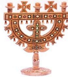
“Triytsia” candleholder from UCEC collection

In the western regions of Ukraine, for ritual purposes, three-candleholders named “Triytsia” (meaning “Trinity”), were used.