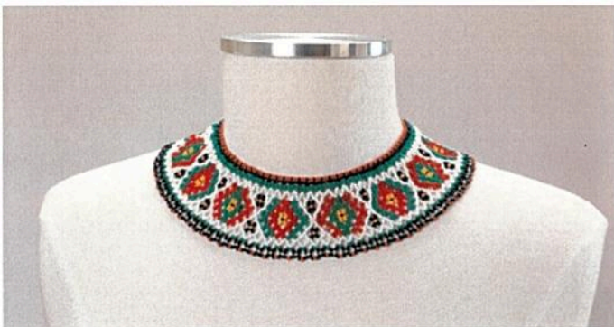
Gerdayn from UCEC collection.

The exhibition “Rediscovering Our Treasures” took place at Oseredok during all of October 2018 in partnership with Tec Voc High School during the Flash Photographic Festival 2018.