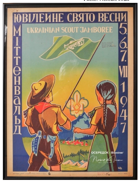
Published by "Plast" Co-operative Society of Scouts, Munich, 1947

This summer Plast Ukrainian Scouting Association is holding an international jamboree near Mittenwald, Germany exactly 50 years since it held its first jamboree outside Ukraine near this city.