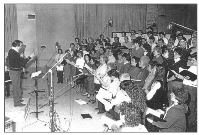
O. Koshetz Choir at Century 21 Studio, 1985

Linking the name of Oleksander Koshetz (1875-1944), renowned choral conductor, composer, arranger and ethnographer, to the young choir of the Ukrainian