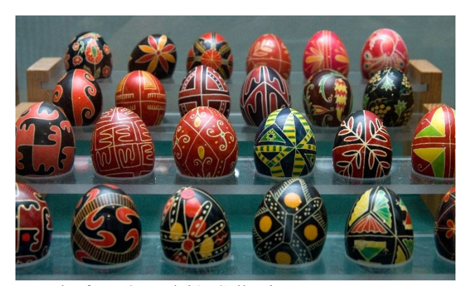
Pysanky from Oseredok's Collection

Family Pysanka Workshops: 2 sessions Saturday, March 25, 2017, 1:30 to 4 pm. and Saturday, April 8, 2017. 1:30 to 4 pm