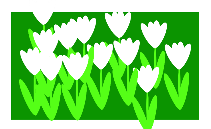
Friday, April 7, 2017, 10 am to 4 pm Saturday, April 8, 2017, 10 am to 4 pm

With Easter falling on the same day in 2017 (Sunday, April 16), the festive Easter season will be enhanced with a sense of unity and joy. This spring (and it will come), Oseredok Boutique will be stocking merchandise that will get you started on creating a sense of renewal. It may be you need a fresh new vyshyvanka , a purse or two, some jewelry to refresh a tired dress or suit, or a new rushnyk for the Easter basket to start a new family tradition.