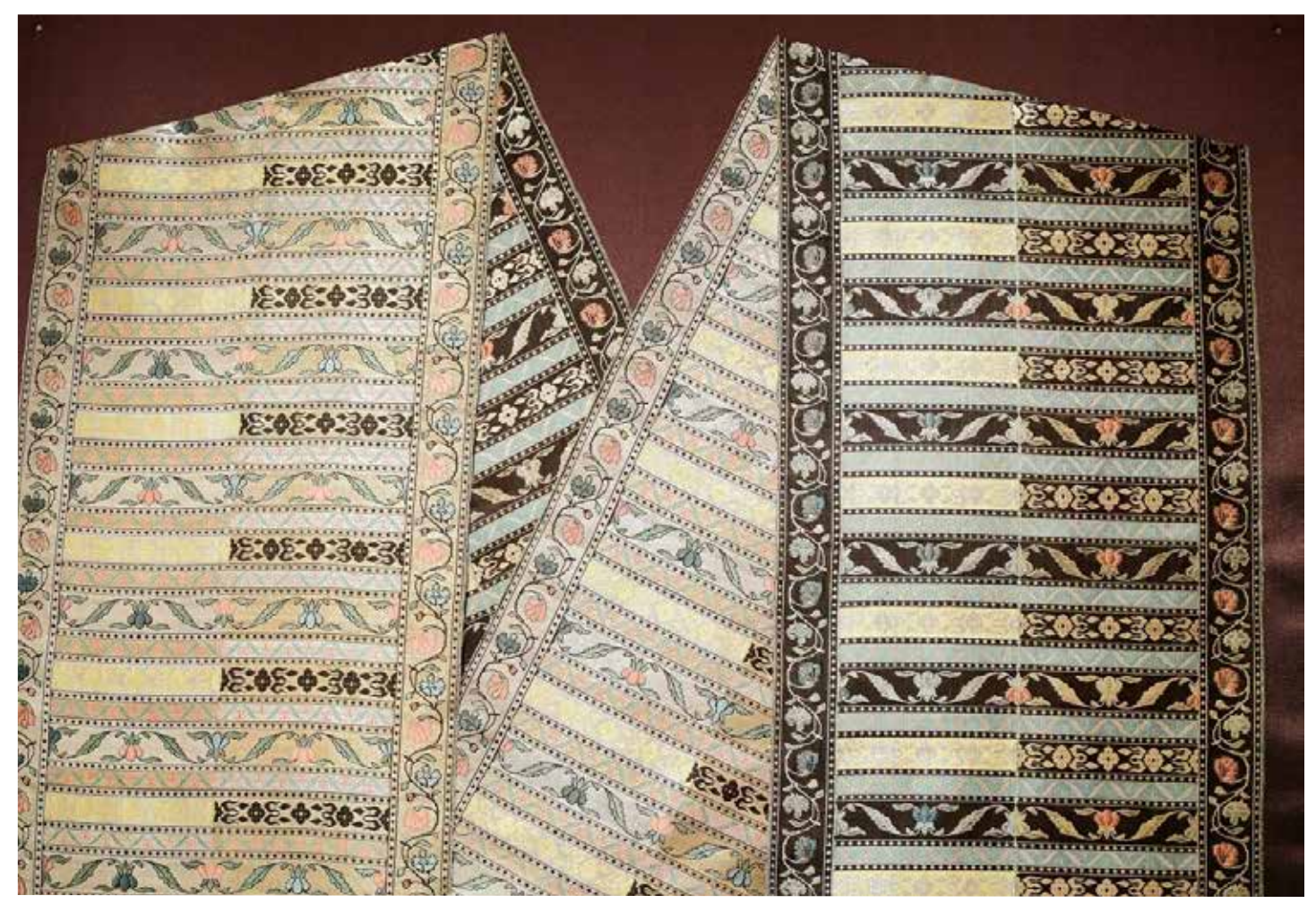
Photo by N. Iwan Sash from Slutsk, 1780, 35.5 x 417 cm. From the Collections of Oseredok Ukrainian Cultural and Educational Centre

Oseredok Ukrainian Cultural and Educational Centre gratefully acknowledges the contribution and support of all partners, organizations and individuals, who make it possible to provide diverse public programs.