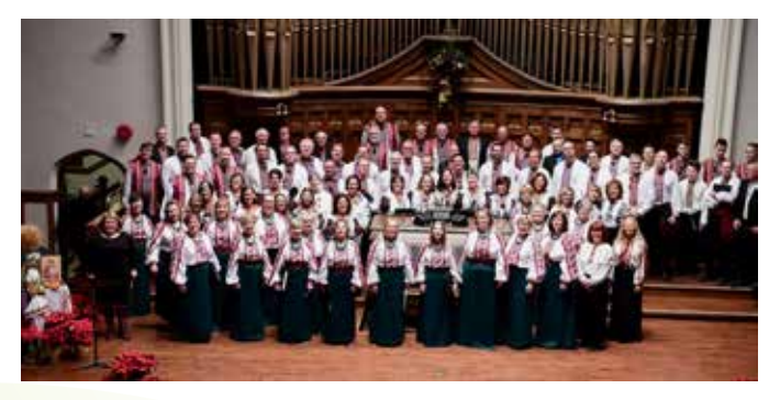
Joined participating choirs of the Festival of Carols