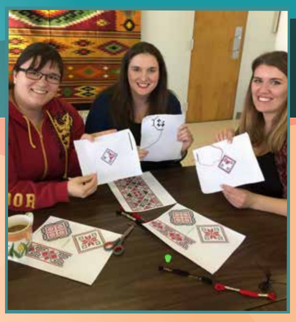
Participants in the Beginners Ukrainian Embroidery Workshop at Oseredok