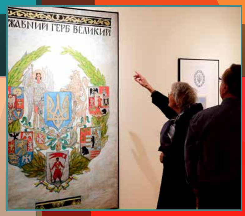
Statehood: 100 Years of the Ukrainian National Republic