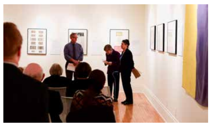
Opening of the Statehood: 100 Years of the Ukrainian National Republic Exhibition