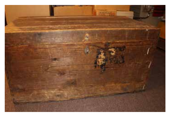
This trunk is a testament to excellent craftsmanship - made in Mohylnytsia, Western Ukraine in early 1944 and travelled with its owners through the many countries until they were settled in Winnipeg. Gift of Walter Kudryk.