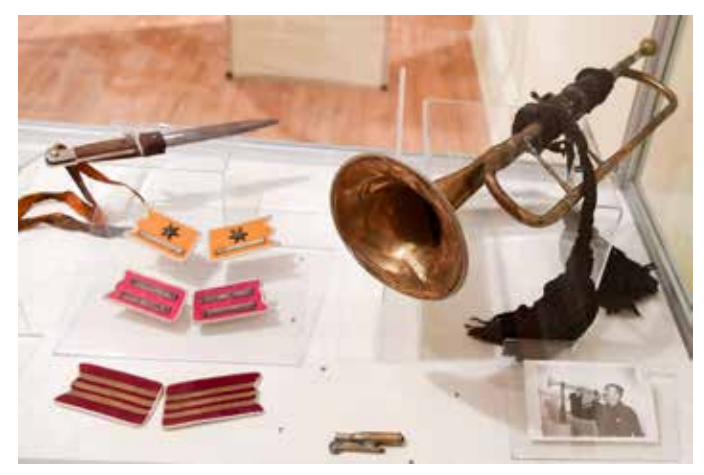
A display of military artifacts from the Statehood: 100 Years of the Ukrainian National Republic Exhibition. From the Collections of UVAN and Oseredok Ukrainian Cultural and Educational Centre.

2018 marks 100 years since the proclamation of Ukrainian independence in Kyiv on January 22, 1918 and the creation of the Ukrainian National Republic (UNR). While short lived, the UNR was the first modern Ukrainian state with all the attributes of statehood and recognition by other nation states. Included in this long-awaited exhibition are artifacts from the collections of the Ukrainian Academy of Arts and Sciences, together with the material from Oseredok's permanent collection.