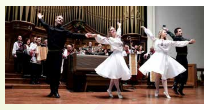
Melos Folk Ensemble performing at the Festival of Carols