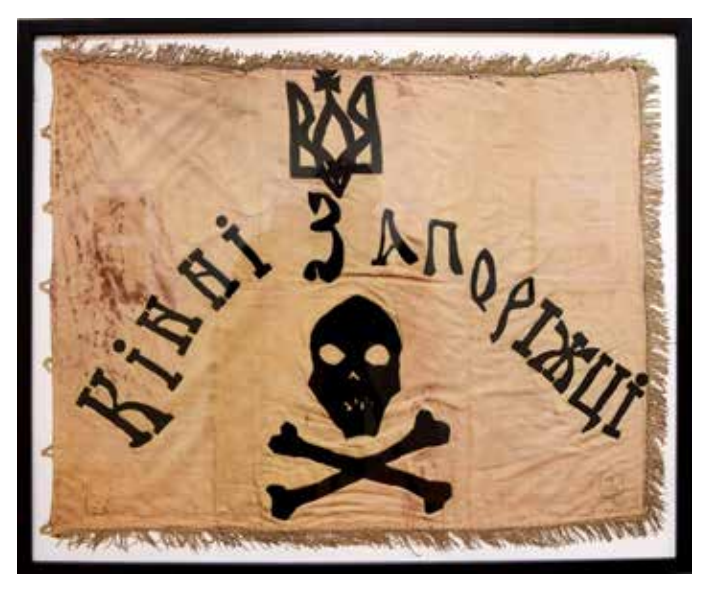
Photo by N. Iwan Guidon (pennant) of the 2nd Cavalry Uman Regiment of Zaporizhia, a Special Cavalry Division of the Army of the Ukrainian National Republic, 1920. From the Collections of UVAN.