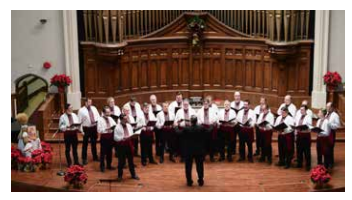
Ukrainian Male Chorus performing at Festival of Carols

Wearing a vyshyvanka is about celebrating or affirming one's identity, creating a sense of cultural pride and national solidarity, and promoting artistic cultural expression.