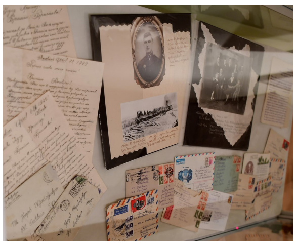
Hoosli 50th Anniversary Exhibition January 21 to March 5, 2019

To celebrate its 50th anniversary, Winnipeg's Hoosli Ukrainian Male Chorus curated a multimedia display of its rich history.