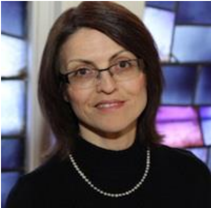
Prof. of Anthropology, Head of the Department of Religions and Culture, St. Thomas More College, University of Saskatchewan